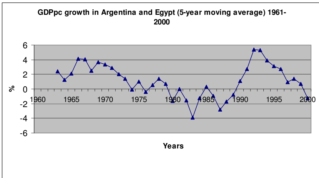
Figure 2: Economic Growth in Argentina during 1961-2000